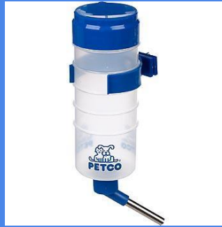
Water Bottles (32 oz.) - @ Petco $11.99