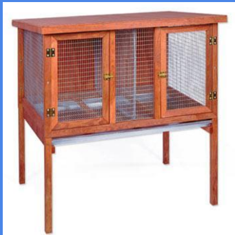
Hutch - @ Petco $299.99