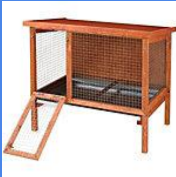
Hutch - @ Tractor Supply $149.99