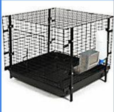
Hutch - tractor supply $49.99

Breeder may have supplies available for purchase