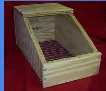
Nesting box (you're going to have to build it. 5x7 wooden sides with a wire bottom)