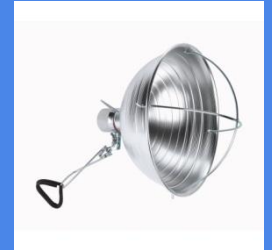
Clamp Light - $17.99 @ Ace Hardware