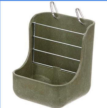
Feeder - @ Petco $11.99