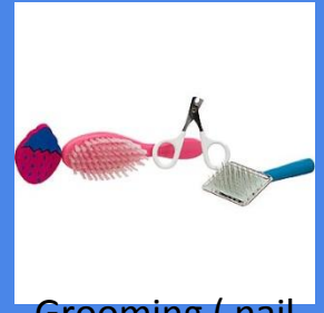
Grooming ( nail clippers and brush) – set $11.99 @ Petco