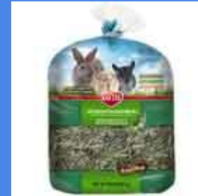
Timothy Hay - @ Petco $7.99